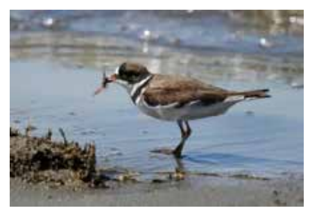
Semi-palmated plovers explore seaweed brought in by the tides. You may also see them shuffle their feet to bring invertebrates to the surface

Also look for brant, loons, scoters, gulls, northern harriers, peregrine falcons, merlin, and bald eagles