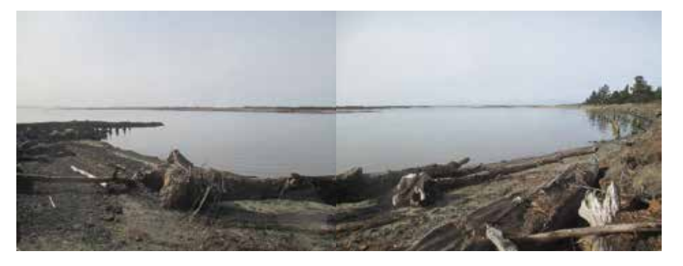
Limited parking at Graveyard Spit

The sand spit and sediment swales that front this area creates a calm bay that is ideal for shorebirds needing to forage and rest with as little energy expense as possible. This one of the best sites for shorebirds especially at low tide with the tidal flats are exposed.