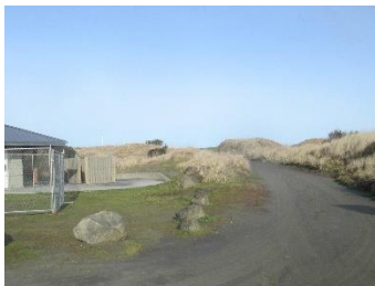
Road to Half Moon Bay

Birds observed: western sandpipers, sanderlings, black turnstones, surfbirds, wandering tattlers, ruddy turnstones, and possibly rock sandpipers. Also keep an eye out for seabirds, loons, and waterfowl.