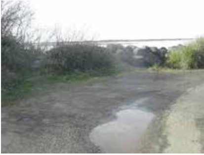
Limited parking at Graveyard Spit